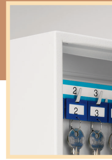
1.5mm pressed steel body

The Securikey System Cabinets are graded in our Bronze category. This range are manufactured to meet the needs of both domestic and light commercial applications. They provide the facility to control and track keys from 20 to 2080 in number and are used extensively throughout businesses worldwide. The cabinet is secured with a very high quality Securikey cam lock as standard and forms the entry level for our large range of key control systems.