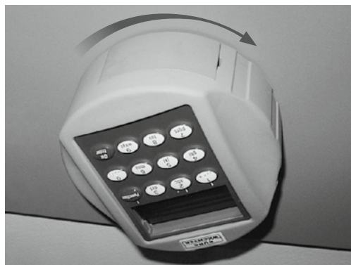
Codeeingabe / Code entry / Entrée code / Code invoer