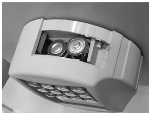
Batterien / Batteries / Batterijen: 2x 1,5V Mignon (LR6)