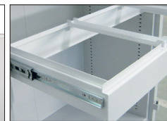
Optional Pull-Out Cradle