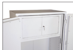
Optional Coffe** (FS1652/53/54 only)

Suitable for storage of controlled drugs whose active ingredients do not exceed 500 grams.