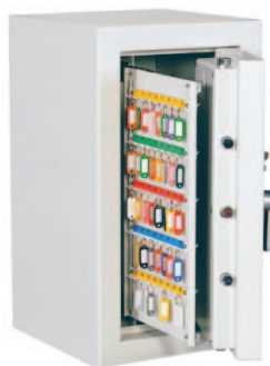
Shown with optional key rack

OPTIONAL EXTRAS AVAILABLE Height adjustable shelves Secu Changeable Key Lock Secu Electronic Lock and Key Lock Cut key only available at time of order unless Secu changeable key lock option is specified Electronic Time Delay Combination Lock Electronic Time Delay and Key Lock Key Rack Set - 80 keys (HS2021) Key Rack Set - 200 keys (HS2022) Key Rack Set - 280 keys (HS2023)